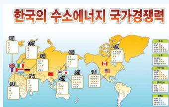
Competitiveness of Korea